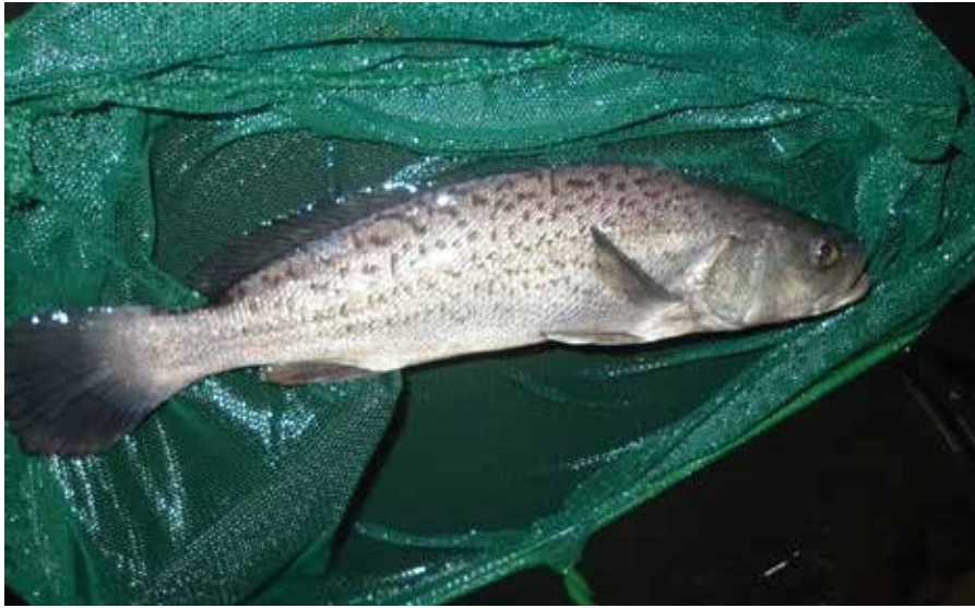
The fast-growing totoaba is now considered a priority species for aquaculture in Mexico.